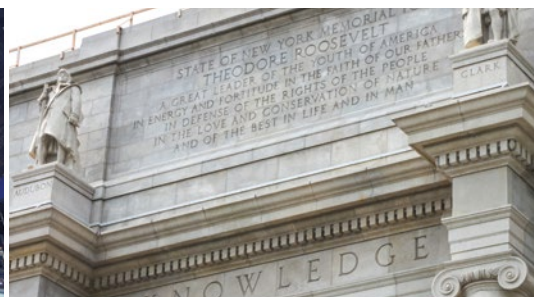
Visit the American Museum of Natural History