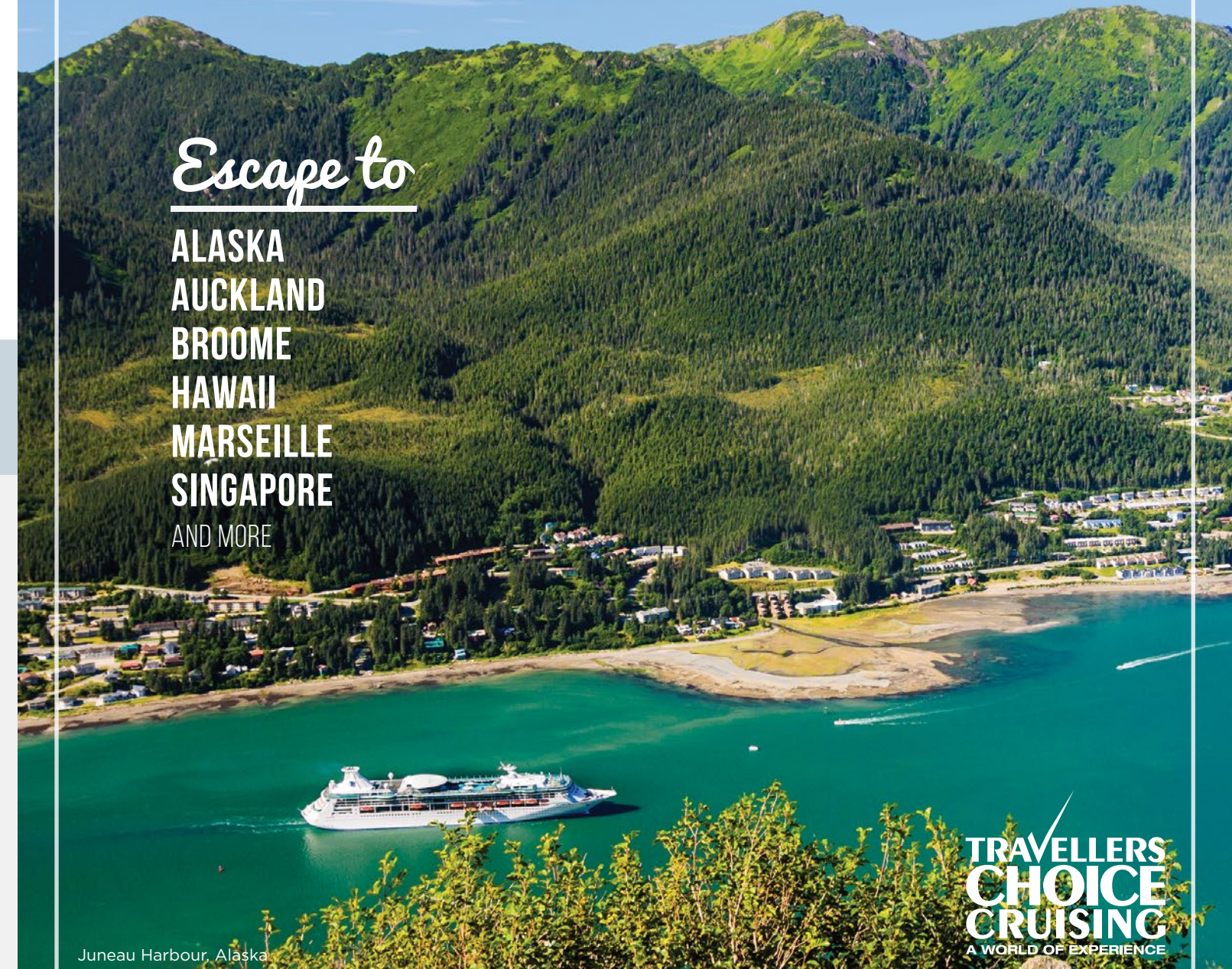
Juneau Harbour, Alaska

TRAVELLERS CHOICE CRUISING A WORLD OF EXPERIENCE