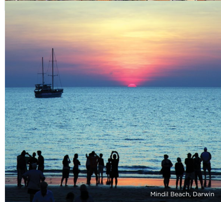
Mindil Beach, Darwin