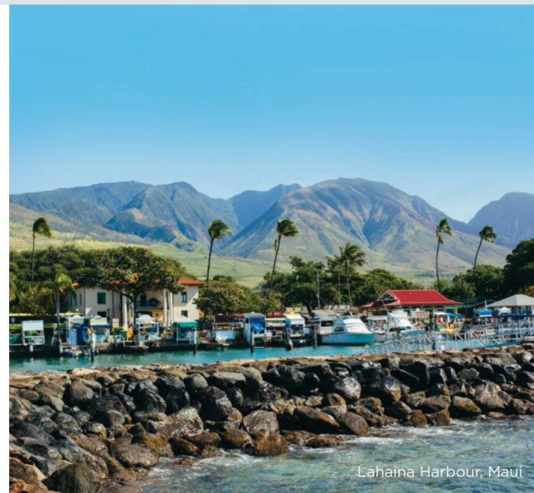
Lahaina Harbour, Maui