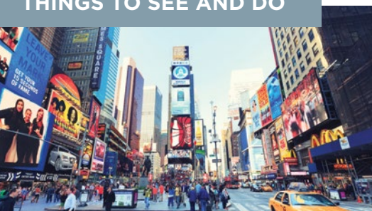
Admire the bright lights in Times Square