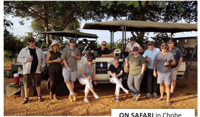
ON SAFARI in Chobe National Park, Botswana.

To find out more visit www.travelagentschoice.com.au .