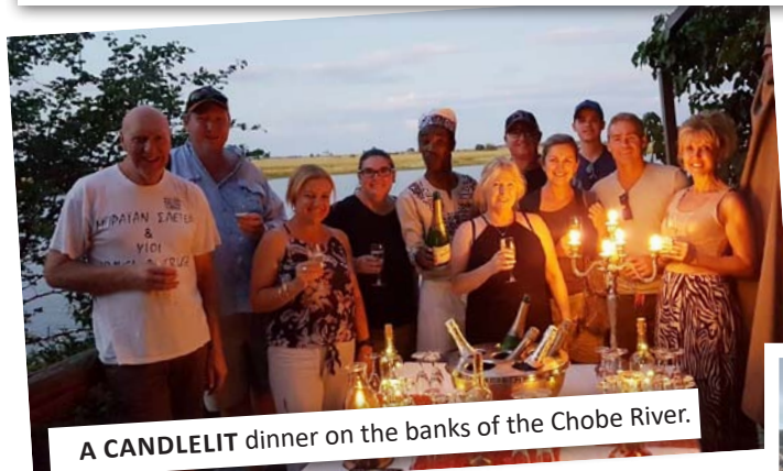
A CANDLELIT dinner on the banks of the Chobe River.