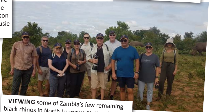
VIEWING some of Zambia's few remaining black rhinos in North Luangwa National Park.